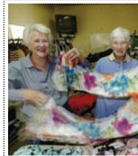
Funky designer pants were just one of the hot items offered for sale at the Albury Fashion Extravaganza.