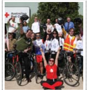
Red Cross Riders around Australia put their hands up in celebration of National Ride to Work Day.