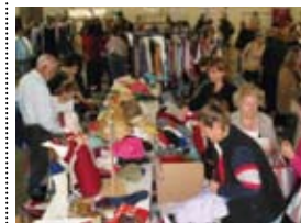
The annual Bindaring Clothing Sale in WA organised by a tireless group of supporters, raises over $70,000 each year.